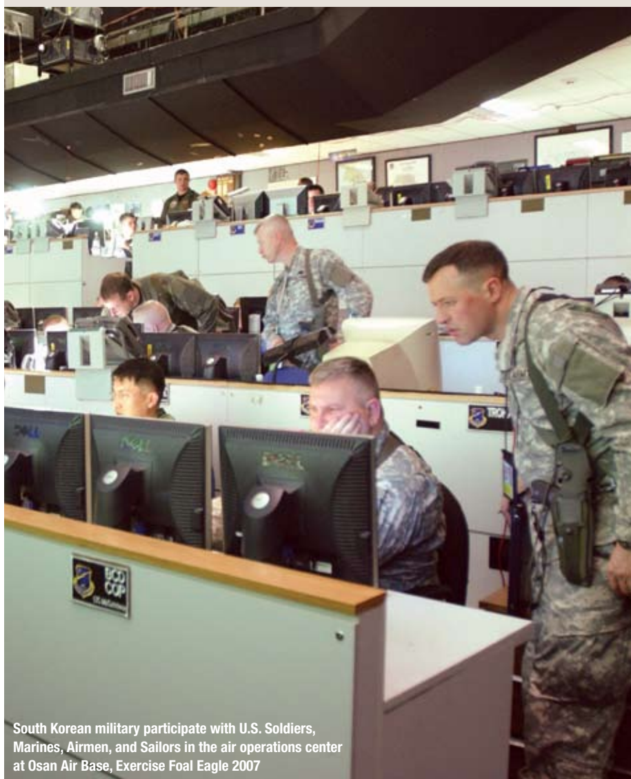
South Korean military participate with U.S. Soldiers, Marines, Airmen, and Sailors in the air operations center at Osan Air Base, Exercise Foal Eagle 2007

—Lieutenant General Walton H. Walker, Commander, 8 th U.S. Army, Korea, 1950 1