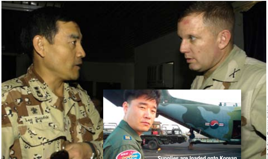
Republic of Korea air force security advisor speaks with U.S. Army officer in Kirkuk, Iraq

Develop and Codify Procedures. The planning processes for both the ATSP concept and the ATSP field training exercise have provided unique opportunities to identify gaps in current policies and procedures. For example, as a result of the field training exercise, the Working Group identified a lack of codified procedures for combined pallet buildup and cargo loading. Resolution of this issue has now become a C 4 Transportation priority. Similarly, ATSP play in various command post exercises uncovered a need for a more structured method of selecting ATSP locations and their respective SAAs and BOS-Is, which, in turn, could work in tandem with future command, control, and communications plans, processes, and time cycles. C 4 Transportation, in concert with C 4 Plans, devised a decision-tree process for this purpose for approval by the ATSP Working Group, and this process will soon find a home in the next edition of the C 4 Logistics, Policies, and Procedures. As these procedural gaps arise, planners should convene the necessary working groups and operational planning